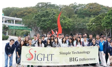
HKUST organized a workshop for local high school students on 25 April 2015.

HKUST Student Innovation for Global Health Technology (SIGHT) and the School of Engineering (SENG) co-organized a workshop for local high school students in April 2015, aiming to share the spirit of community service on global health with sustainable technology. The workshop not only demonstrated how life could be improved by technology, but it also raised the awareness of students on issues relating to global health, as well as the importance of taking part in community services.