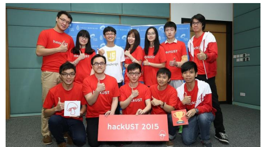
The first university student-led Hackathon in Hong Kong was successfully held on 28-29 March 2015 at HKUST