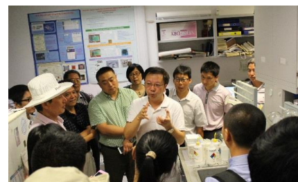
SRI invited SZMMA to visit University and some laboratories.