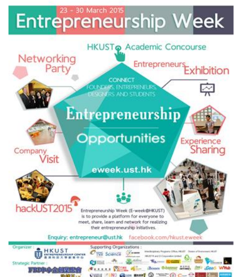
Entrepreneurship Week @ HKUST, 23-30 Mar 2015

The Innovation & Entrepreneurship Training Camp was an annual event with 50 participants from HK, China, Africa, Russia, Taiwan and Macau. It aimed to aspire pre-entrepreneurs and young entrepreneurs to shape their business idea into executable and fundable business plan. Participants were given a systematic training aimed at providing in-depth knowledge on issues, concepts and skills unique to the need of an innovative or entrepreneurial project.