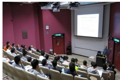
IP Seminar: Best Timing for IP Protection— Publication vs Patent Application