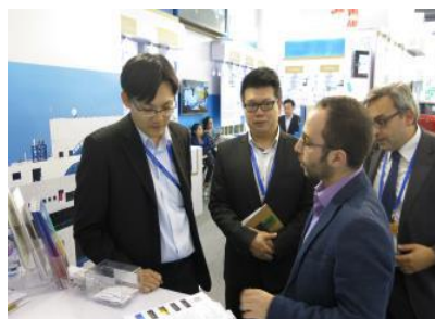
HKUST presented the latest research achievement to audience from overseas