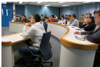
IP Seminar: Best Strategy to Protect Biotech Invention

Two campus-wide IP seminars were organized during the year to equip researchers with more IP management knowledge and skills. The first one “Best Timing for IP Protection” provided a practical guide to HKUST members on how to better extract value from their inventions and how to balance the need to publish their work and the necessity of protecting their work through the patent process. The second one “Best Strategy to Protect Biotech Invention” attracted a full-house of attendees.