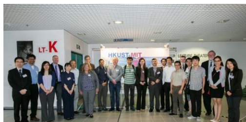
The Semi-Annual Review of Projects in June 2015 at HKUST

The HKUST-MIT Alliance aims to build the network and mechanism required for R&D collaboration between world class universities and technology companies and conduct industry-driven pre-competitive research. By the end of 2014/15, this Consortium has received a total of 9 new proposals from local universities, in which three were highly recommended and submitted to the Innovation & Technology Commission for funding application under the Data Science & E-Learning cluster.