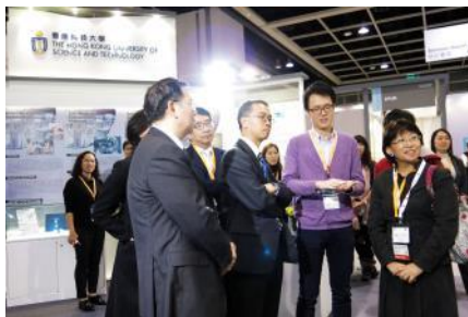
HKUST's Booth at the HK Tech Showcase @IDT Expo