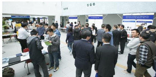
Aero Day at HKUST on 24 Feb 2015

The first Aero Day was organized by MAE and AIAA in HKUST, with aims to present the development of the aviation industry, both locally and internationally, and to allow students to understand the career opportunities offered in the industry. This event featured exhibitions and presentations by industrial partners ranging from airlines, maintenance and repair organizations, original equipment manufacturers, to government agencies and professional organizations, which gave students a comprehensive picture of the aviation industry. A highlight of the exhibition was the experience on riding flight simulator, set up by the HKUST Aeronautics Interest Group (AIG) with a flying game and control device.