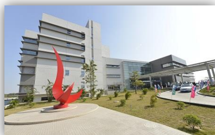
New FYTRI Building at Nansha IT Park, opened in December 2014

Positioned as the University’s technology transfer and commercialization platform in the Mainland, The HKUST Fok Ying Tung Research Institute (FYTRI) is fully committed to promoting technology transfer on various fronts. FYTRI’s new campus building located at Nansha IT Park was officially opened in Dec 2014, with a total floor area of 36,000 sq. meters and advanced labs and facilities for research and education. With this new campus building in place, FYTRI is well positioned to capture new opportunities emerging in the district of Nansha, which has become part of the China (Guangdong) Pilot Free Trade Zone (中國廣東自由貿易試驗區) since the end of 2014. To cope with the new development, the Technology Marketing and Incubation Office