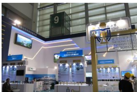
Golden and blue were chosen to be the colour theme of the booth to match with the university symbol

China Hi-Tech Fair (CHTF) is one of the largest high-tech trade events in China. Since its inception in 1999, the fair has provided universities and high-technology sectors a platform for showcasing technology and enhancing publicity in the Mainland. HKUST organized the participation of our units to the 16 th CHTF showcasing available technologies and research achievements, and seeking for networking opportunities and potential collaboration.