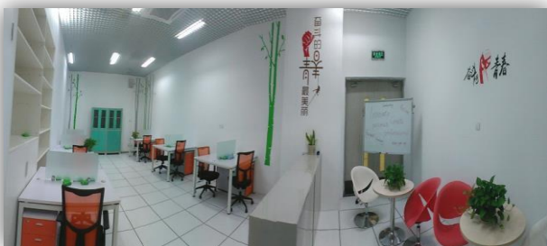
The newly established Entrepreneur Center

SRI is dedicated to facilitating technology and knowledge transfer and offering support in various aspects. The “Incubator Express” program and the newly established Entrepreneur Center are set to encourage entrepreneurship and innovations. Up to Jun 30, 2015, 14 start-up companies have been established by HKUST professors or alumni in the HKUST IER Building, covering various fields such as biological recognition, mobile health, internet finance, automatic control,