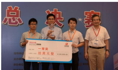
The PiCode team received the first place award

Striving to encourage and support development of technology startups in