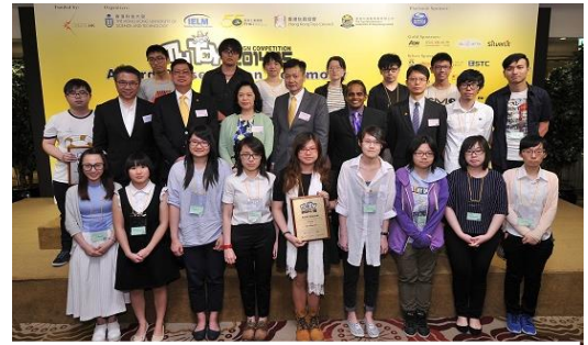
The 2nd My Toy Design Competition Award Presentation Ceremony