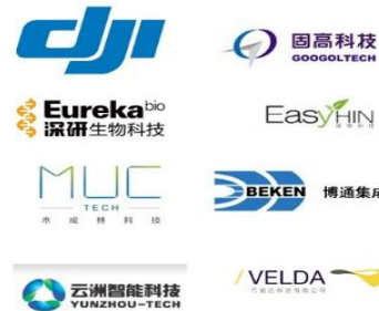
Start-up enterprises stationed in IER Building

The HKUST Shenzhen Research Institute (SRI) continues to play a vital role in the University’s innovation and technology advancement in the Mainland. SRI has been approved as the supporting organization of NSFC since 2011 and has developed extensive collaborations with research institutions and enterprises in the Mainland. The six centers and labs specialized in the fields of molecular neuroscience, novel emissive material, traditional Chinese medicine, automation & UAV, marine environment and livelihood have shown distinguished research capacity and outputs. Another five collaborative labs are hosted jointly by SRI and industrial partners with the aim of accelerating technology transfer and enhancing applied research collaboration.