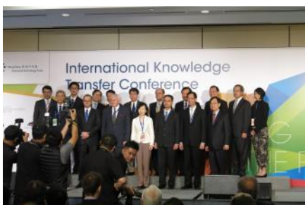
International Knowledge Transfer Conference