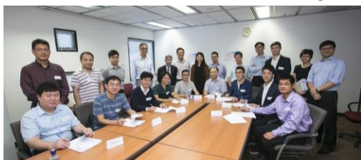
TSSSU 2015/16 Start-up Awardees attended the Signing Ceremony on 4 June 2015.

In response to the Technology Start-up Support Scheme for Universities (“TSSSU”) launched last year by ITC, HKUST has strengthened its support to our faculty, students, staff, and alumni who plan to set up startup company. Led by OKT, TTC and RDC offer assistance in translating new ideas into business