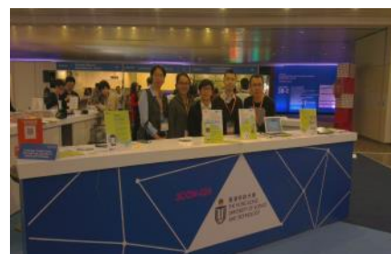
HKUST faculties and students showcased their mobile app projects at ICT Expo

The purpose of the App Zone Exhibition is to offer an opportunity for University faculties and students to display their mobile app projects in order to engage with the society and establish collaboration with the industry. Four Apps developed by HKUST faculties and students were showcased in the App Zone this year.