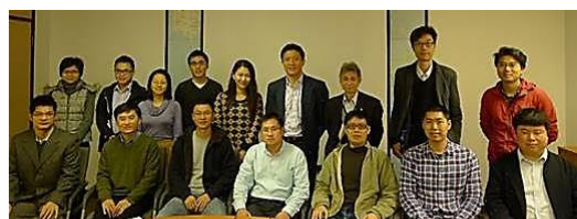
TSSSU 2014/15 Start-up Awardees attended the Signing Ceremony on 3 Feb 2015.

their business proposal, in their budget planning as well as year-end evaluation with individual start-up company. This scheme successfully launched in HKUST has attracted respectively 13 and 23 applications in the government financial year of 2014/15 and 2015/16. Among these applications, TSSSU funding has been awarded to 7 start-ups for 2014/15 and 9 start-ups for 2015/16.