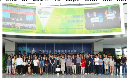
“Redbird Entrepreneur Cradle” (紅鳥創業苗圃) held in Nansha in Jan 2015.

During the reporting year, FYTRI has organized five entrepreneurial training workshops under the “Redbird Entrepreneur Cradle” (紅鳥創業苗圃) Program. Over 500 participants comprising FYTRI staff and students from other Mainland universities attended. In this connection, the “DIY Center” is being established in FYTRI campus building to provide hardware support to HKUST faculty, students, and young entrepreneurs who have built or intend to build start-ups. Recognizing FYTRI’s efforts in advancing technology transfer and