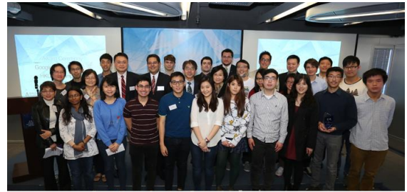
An awards presentation ceremony to recognize the outstanding work of the HKUST faculty and student awardees held on 18 March 2015

Rooted in the great effort of HKUST's faculty and researchers to pursue excellence in innovation, there is evidence of a steady number of reported innovations. The invention review and screening process has been strengthened to facilitate strategic development of major technology patent portfolios, such as novel acoustic materials, aggregation-induced emission materials and their applications, the SANI wastewater treatment and a series of novel medical devices. Overall during the reporting year 139 inventions were disclosed and 199 new patent applications filed. With 73 newly granted patents, the University's current IP portfolio, including our satellite campus, contains 940 active patents and patent applications.